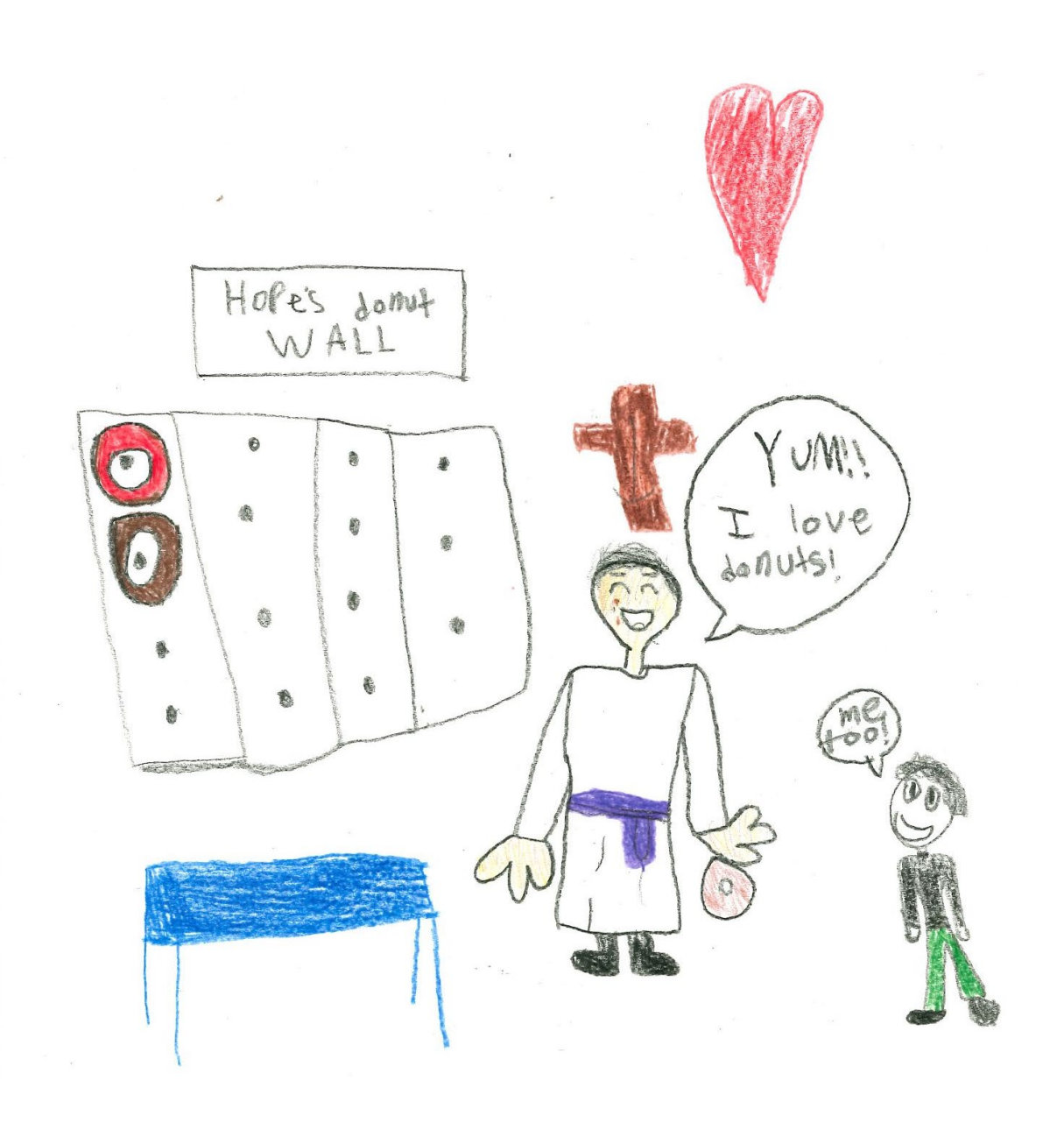
APRIL 21, 2024 9:00 AM