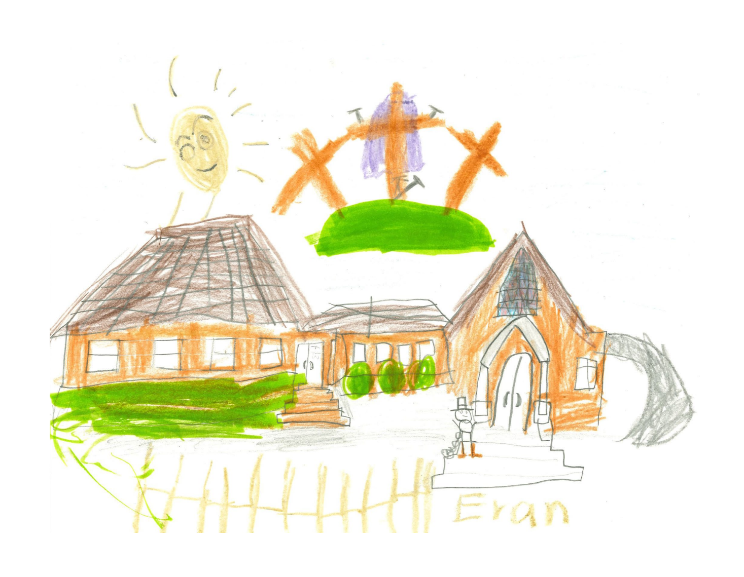
APRIL 20, 2024 5:00 PM